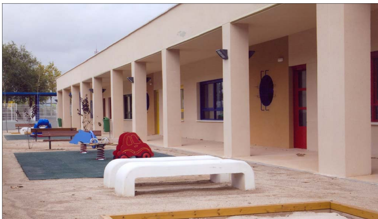
NURSERY SCHOOL IN LOS MADROÑOS STREET, ALCORCON, MADRID

Nursery School: 10 classrooms with toilets and changing rooms – Multipurpose room – Office and administrative area – Outdoor playgrounds – Adapted accesses for people with reduced mobility – Gardens – Staff and pram-adapted car park