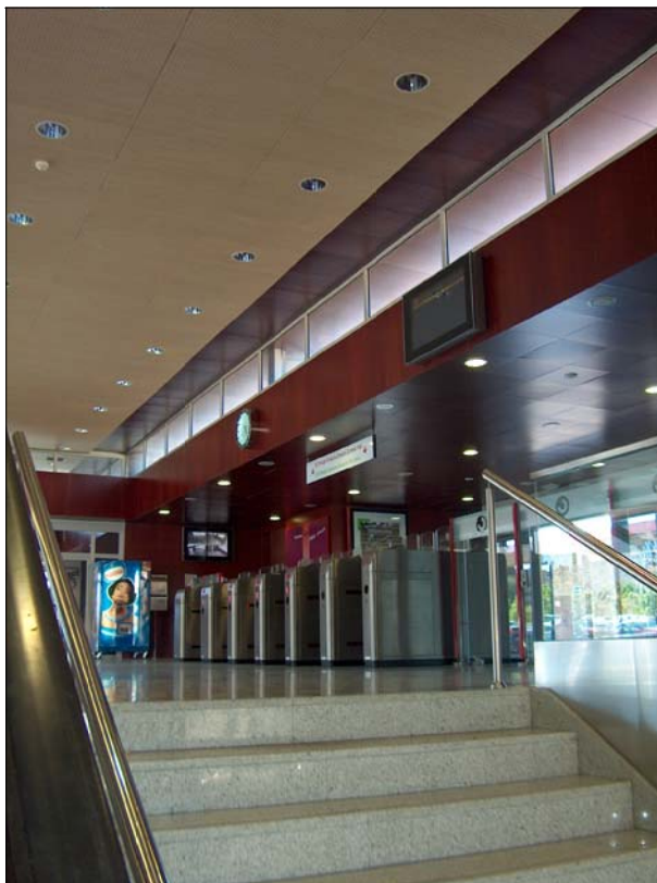
ARAVACA STATION, MADRID

Car park – Motorcycles and bicycles park – Taxi Stop – Urban and intercity bus stop – Adaptation to people with reduced mobility Installation of lifts – New passenger building