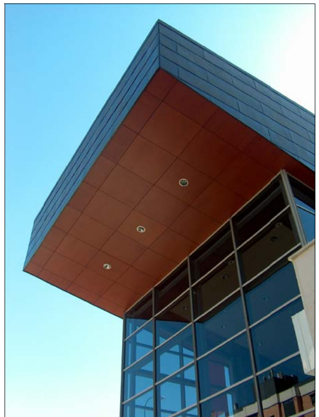
COMMUNITY OF MADRID

OWNERSHIP: ADIF BUDGET: 1.366.090,92 € / YEAR: 2002