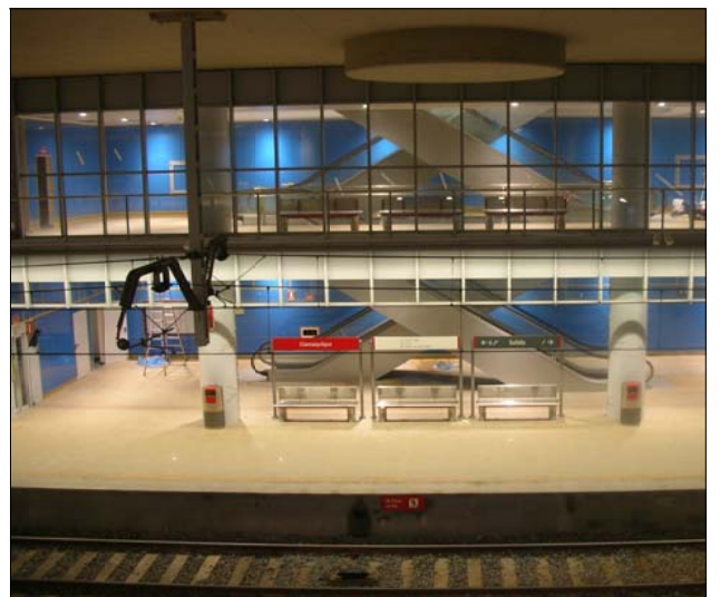
LLAMAQUIQUE STATION, OVIEDO