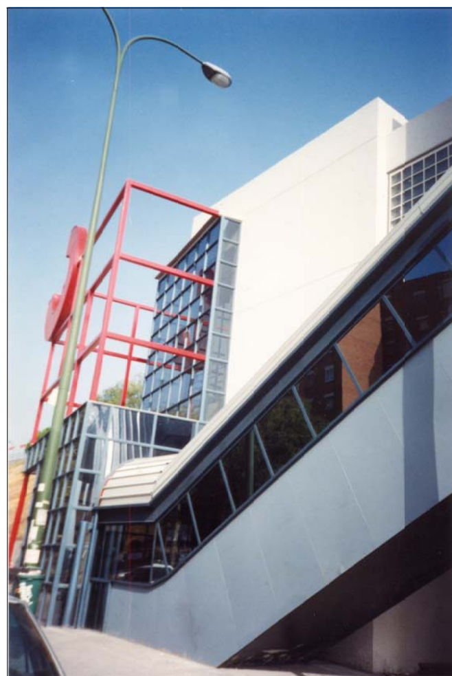
COMMUNITY OF MADRID

OWNERSHIP: ADIF BUDGET: 836.500,66 € / YEAR: 2000