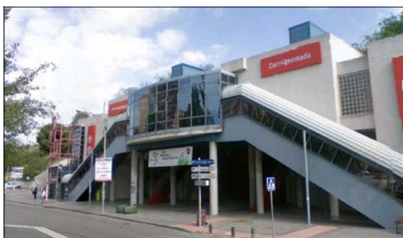
ZARZAQUEMADA STATION IN LEGANES, MADRID