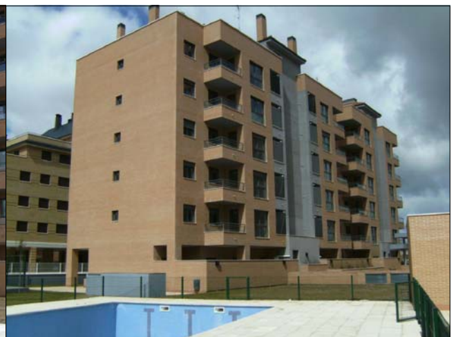
84 HOMES BUILDING, LUMBER ROOMS, GARAGE AND SWIMMING POOL IN ZAMORA